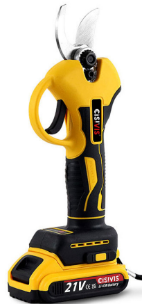
Brushless Lithium-ion Pruning Shears DJD0011