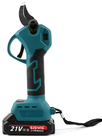
Brushless Lithium-ion Pruning Shears DJD0003