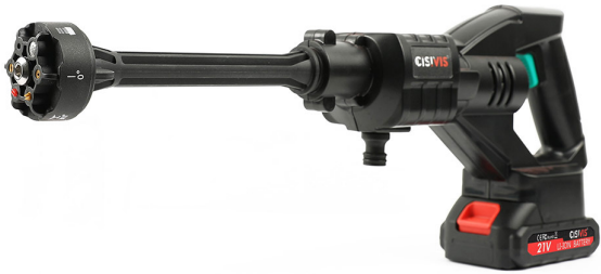
Brushed Lithium-ion Car Wash Gun