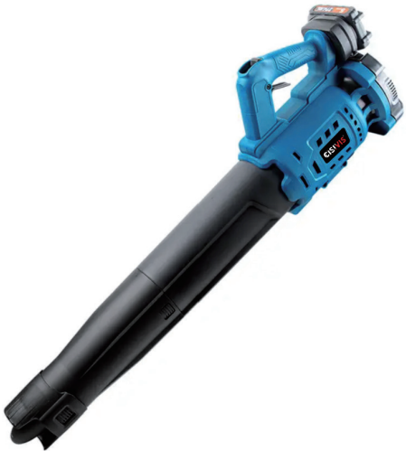
Brushless Lithium-ion Leaf Blower BFJ0003