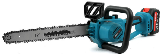
12"Brushless Lithium-ion Chainsaw DJ00020