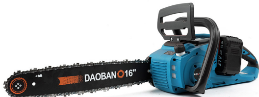
16"Brushless Lithium-ion Chainsaw DJ00012