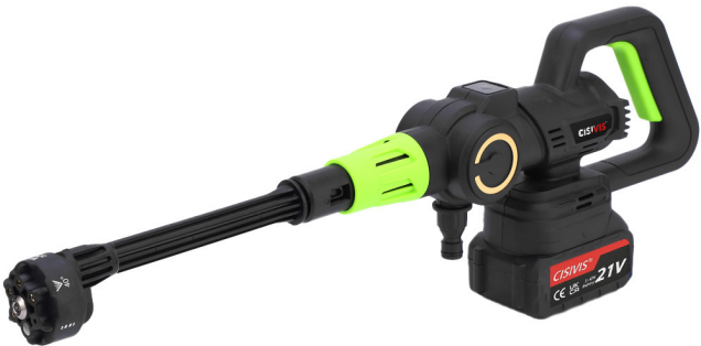
Brushed Lithium-ion Car Wash Gun