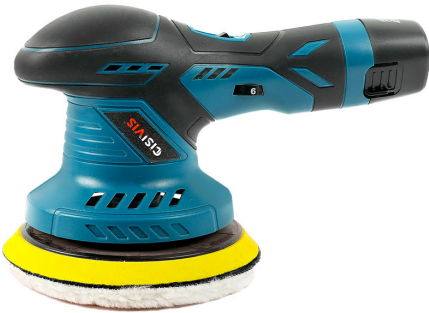
Lithium-ion Polishing and Waxing Machine PGJ0007