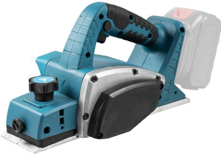
Electric planer DP0002