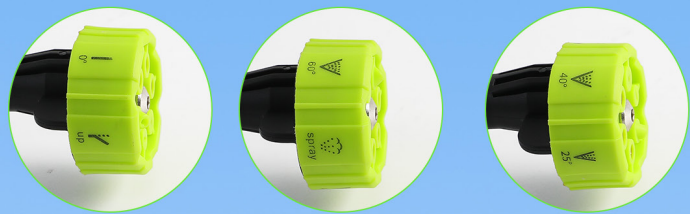
Brushed Lithium-ion Car Wash Gun