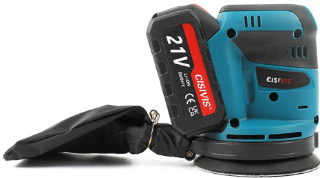
Lithium-ion Orbital Sander YSJ0001