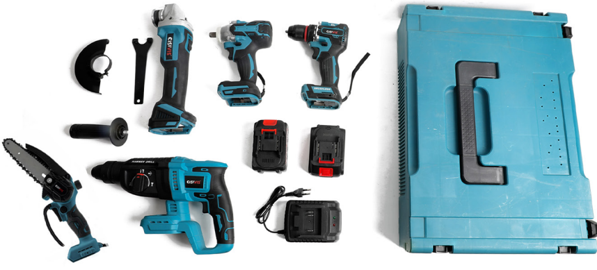
5-PIECE COMBINATION SET