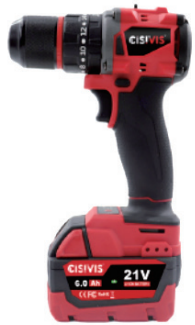
Brushless Lithium-ion Electric Drill DZ0010