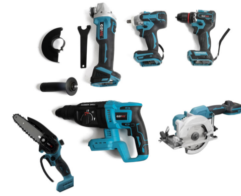
6-PIECE COMBINATION SET