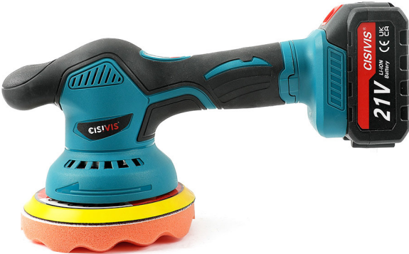
Lithium-ion Polishing and Waxing Machine PGJ0001