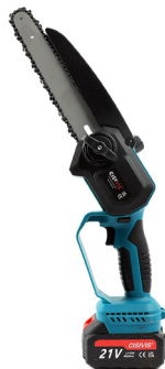
8"Brushless Lithium-ion Chainsaw DJ00019