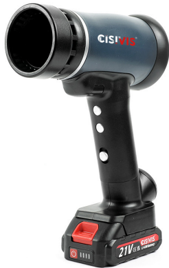
Lithium-ion Turbo Blower BFJ0005