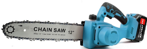
12"Brushless Lithium-ion Chainsaw DJ00010