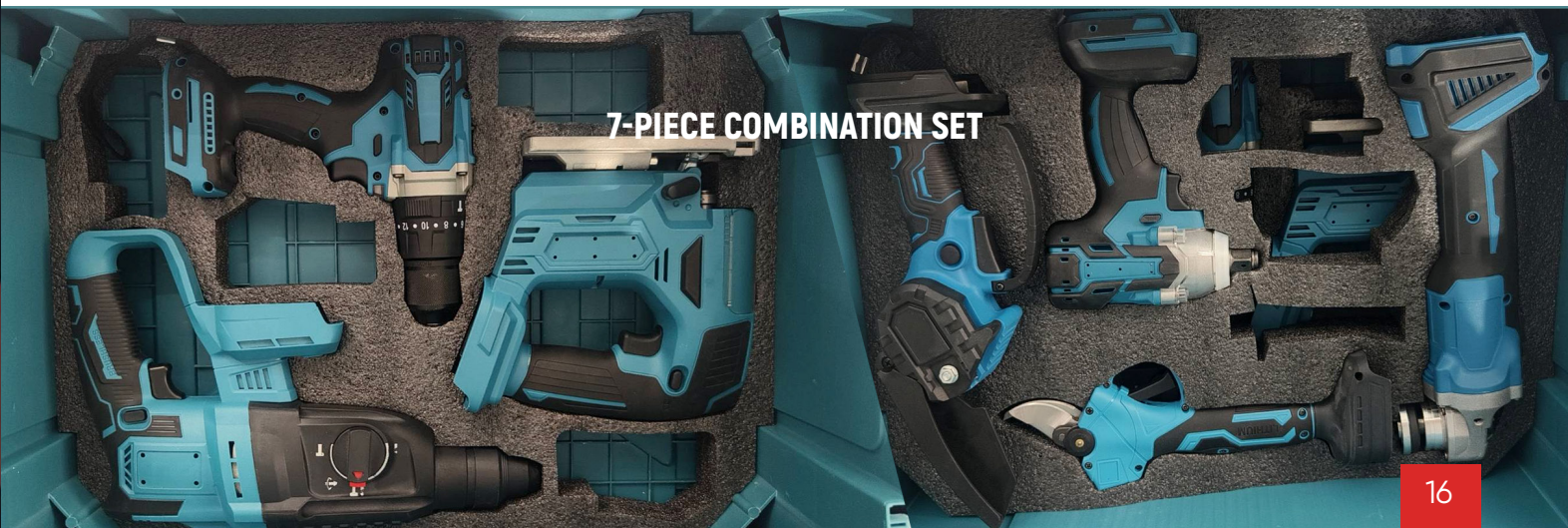
7-PIECE COMBINATION SET