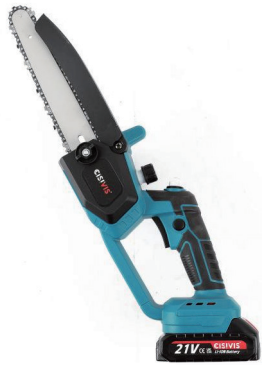
8" Brushed Lithium-ion Chainsaw DJ0007-1