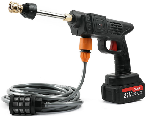
Brushed Lithium-ion Car Wash Gun