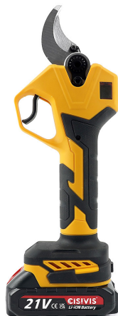
Brushless Lithium-ion Pruning Shears DJD0005