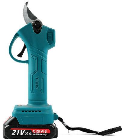
Brushless Lithium-ion Pruning Shears DJD0002