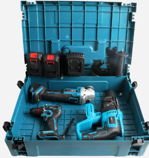
3-PIECE COMBINATION SET