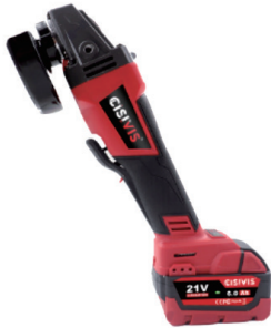
Brushless Lithium-ion Electric Angle grinder DZ0010