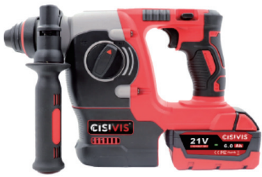
Brushless Lithium-ion Electric Hammer DZ0010