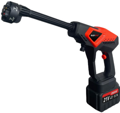
Brushless Lithium-ion Car Wash Gun