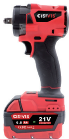
Brushless Lithium-ion Electric Wrench DZ0010