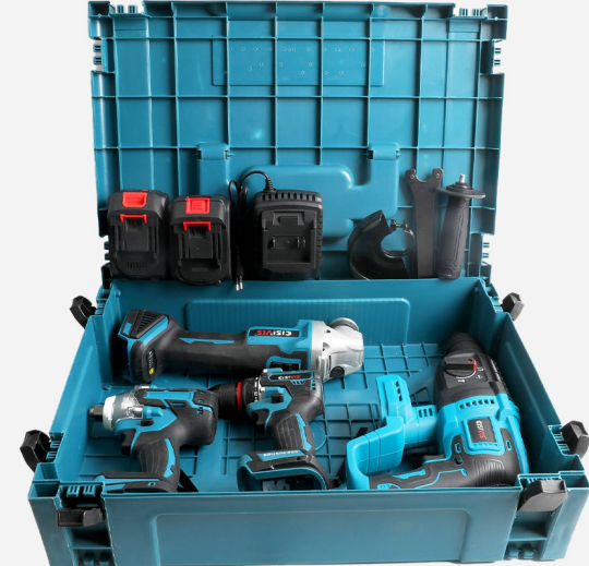
4-PIECE COMBINATION SET