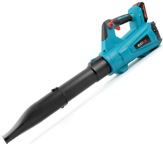
Brushless Lithium-ion Leaf Blower BFJ0002